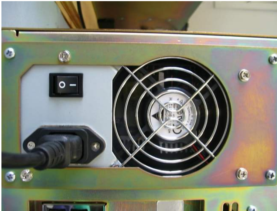
Figure 4: PC Power & Cooling Turbo-Cool 510XE - recommended replacement