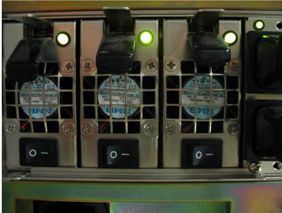
Figure 3: Triple-redundant supply - OK