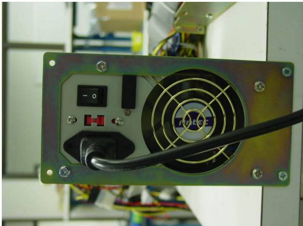
Figure 2: Good Antec True550; fan may not be labeled “Antec”